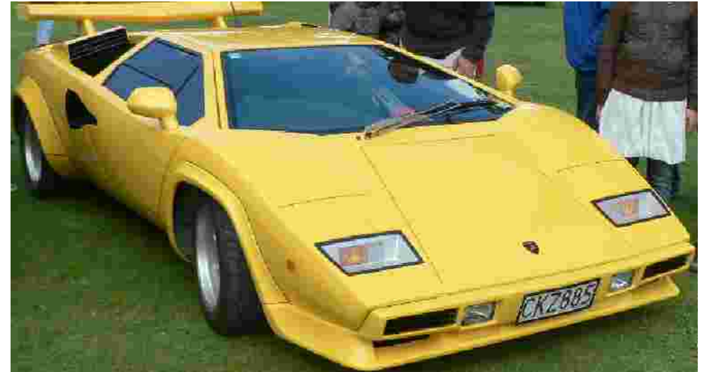
A Lamborghini Countach at the Naseby Vintage & Classic Vehicle day.

Take a look for yourself at www.freeservers.com