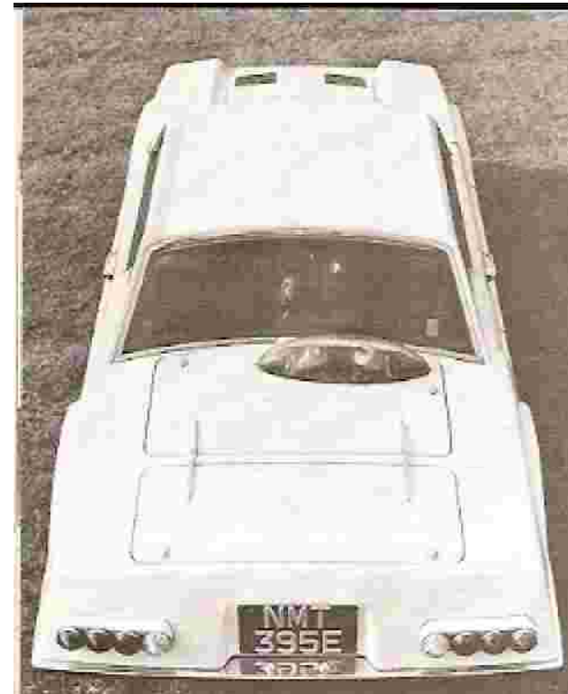
P6BS from above—one hatch covers the engine, while the other gives access to the stowage boot. In prototype form the carburettors were visible under a Perspex cover.