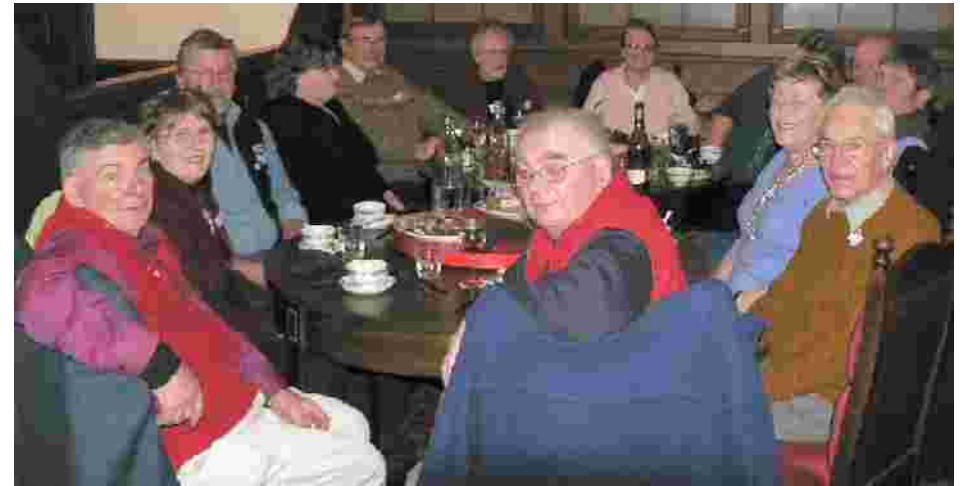
AGM Dinner, July 2008

The meeting closed at 8.30pm, followed by general discussion ns 7/8/2008