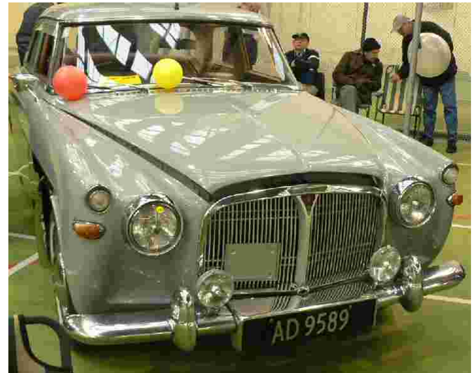
Len Wither`s 1961 P5 at the 2008 Auto-spectacular