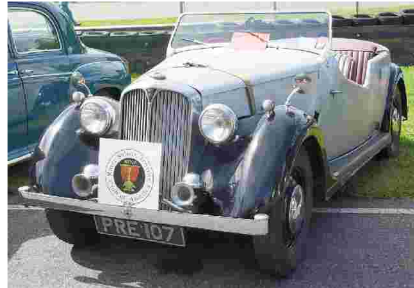
1947 Rover Tou